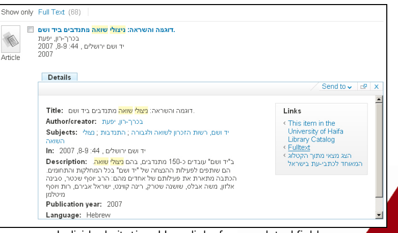
Individual citation: Hyperlinks for populated fields (author, subjects, etc.)