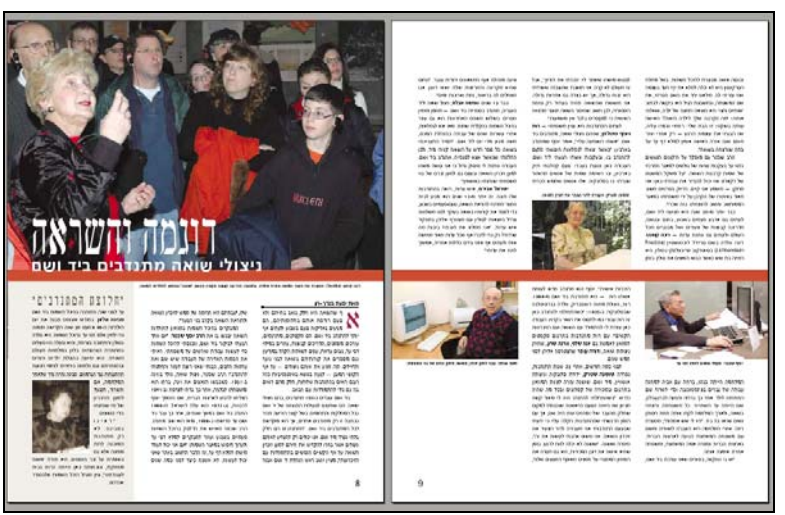
View full-text or full-image, if available.

A project of Tel-Hai College Library in Upper Galilee, where indexing was produced and then input by the University of Haifa. Newspapers captured: Ha'aretz, Hatsofeh , Al-Hamishmar, Davar, Ma'ariv , Yediot Aharonot and Hadashot (until its closing). Particular emphasis given to longer, analytical articles on social, economic, and political topics (including "op-ed" articles) as well as significant reviews of books, exhibitions, theater, and other cultural events. THIHN contains 188,500 newspaper articles from